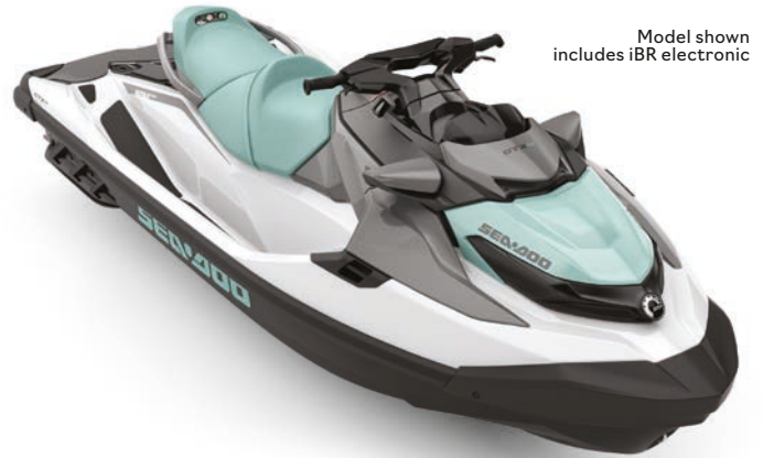
Model shown includes iBR electronic