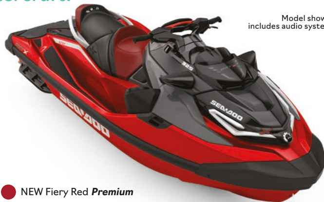
Model shown includes audio system